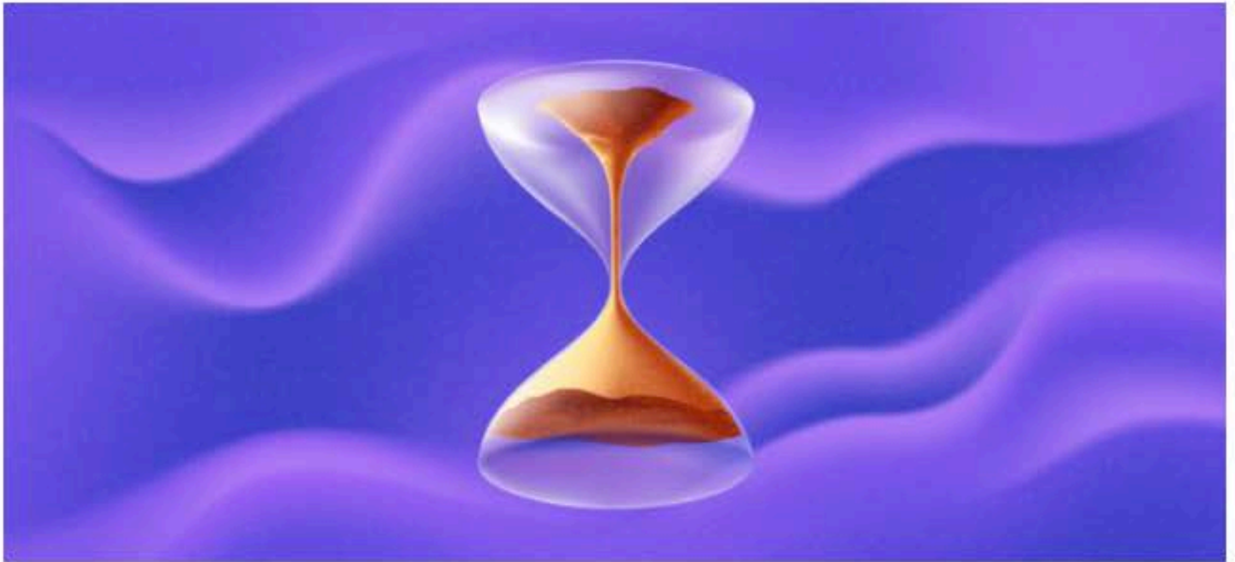
IMAGE: THE second most popular release FEATURED AN ILLUSTRATION DEPICTING "TIME REVERSAL."

In long-term heterosexual relationships, passion is the only factor that determines the frequency of sex, according to the 5th most-visited release from the Norwegian University of Science and Technology.