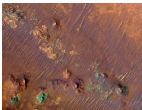
A NASA orbiter set to launch towards Mars in 2016 will focus on measuring trace atmospheric gases like methane, which might have a biological source. This region of Mars, called Nili Fossae, appears to be a 'hotspot' for the gas