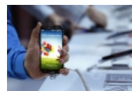
Samsung Galaxy S5 Release Date Rumors, Specs: 64-Bit Confirmed; Concept Revealed [VIDEO]