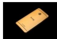
HTC One Verizon, Review, Mini, Max, Case: Gold HTC One Unveiled in First Leaked Photos [VIDEO]