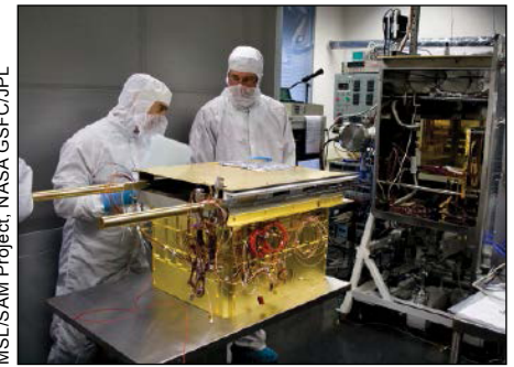
MSL/SAM Project.